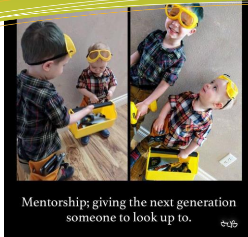
Mentorship; giving the next generation someone to look up to.